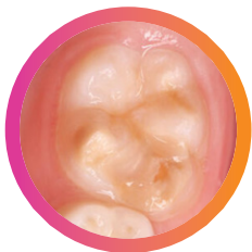
Dental developmental defects and chalky teeth