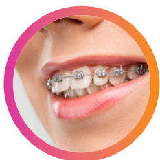
During and after orthodontics (braces and clear aligners)