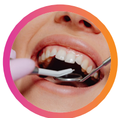
After professional cleaning and scaling