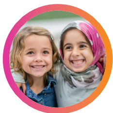
Children and adolescents