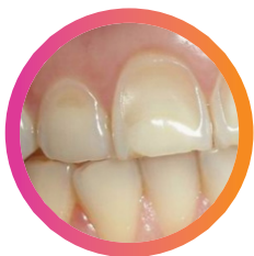
Erosion, reflux and morning sickness