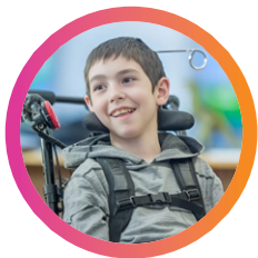
Aged care and special needs