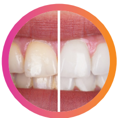
Before and after tooth whitening