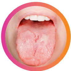
Dry mouth conditions and Xerostomia