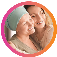
Chronic disease sufferers and multiple medication use